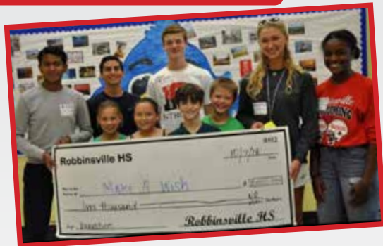
Parents of students attending Robbinsville High School and Sharon Elementary School donated $2,000 to the Make-A-Wish Foundation during Back to School Night.